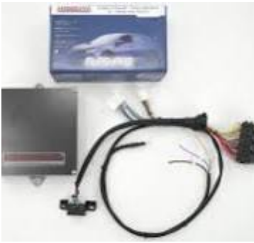
Figure Hondata: Honda/Acura Engine Management Solutions

2002 Acura MDX - Interior | Part 1 - Honda Newsroom , MDX's 4500-pound boat towing package (3500-pound for trailers) was achieved by tuning the powertrain and chassis systems to manage heavy loads with confidence. hondanews.com/releases/2002-acura-mdx-interior-part?query=2002+acura+mdx&page=2#:~:text=Integrated headrests and electric heating elements are standard in both front seats