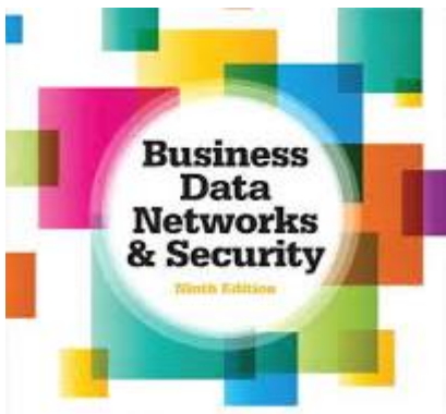
Figure Business Data Networks and Security (9th Edition)

Business Data Networks and Security (9th Edition) , Business Data Networks and Telecommunications guides readers through the details of networking with its clear writing style, job-ready detail, and focus on the ... amazon.com/Business-Data-Networks-Security-9th/dp/0132742934