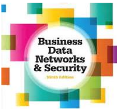
Figure Business Data Networks and Security (9th Edition)

Business Data Networks and Security (9th Edition) , Business Data Networks and Telecommunications guides readers through the details of networking with its clear writing style, job-ready detail, and focus on the ... amazon.com/Business-Data-Networks-Security-9th/dp/0132742934