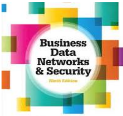
Figure Business Data Networks and Security (9th Edition)

Business Data Networks and Security (9th Edition) , Business Data Networks and Telecommunications guides readers through the details of networking with its clear writing style, job-ready detail, and focus on the ... amazon.com/Business-Data-Networks-Security-9th/dp/0132742934