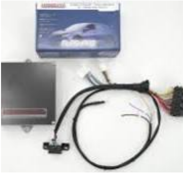
Figure Honda: Honda/Acura Engine Management Solutions

and. http://techinfo.honda.com/rjanisis/pubs/OM/AH/B3V0202OM/enu/MD0202OM.pdf