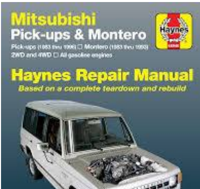
Figure Mitsubishi Pickup & Montero '83'96 (Haynes Repair Manuals)

2000 Mitsubishi Montero Pricing and Specs , Features · 3.5L V-6 Engine · 4-spd auto w/OD Transmission · 200 @ 5,000 rpm Horsepower · 228 @ 3,500 rpm Torque · four-wheel Drive type · 15" silver aluminum ... autoblog.com/buy/2000-Mitsubishi-Montero/specs/