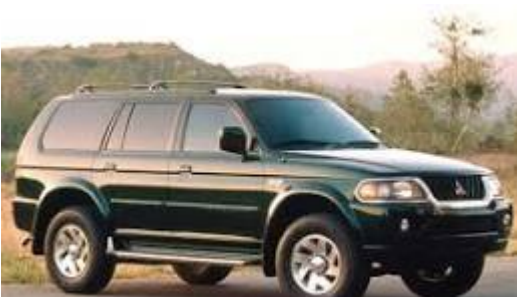
Figure 2000 Mitsubishi Montero Sport Review & Ratings | Edmunds

Used 2000 Mitsubishi Montero - Kelley Blue Book , Used 2000 Mitsubishi Montero pricing starts at $3,385 for the Montero Sport Utility 4D, which had a starting MSRP of $32,262 when new. The range-topping 2000 ... kbb com/mitsubishi/montero/2000/