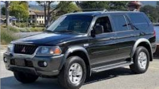
Figure 2000 Mitsubishi Montero Sport XLS RWD

Used 2000 Mitsubishi Montero for Sale Near Me , Save money on one of 21 used 2000 Mitsubishi Monteros near you. Find your perfect car with Edmunds expert reviews, car comparisons, ... edmunds com/mitsubishi/montero/2000/