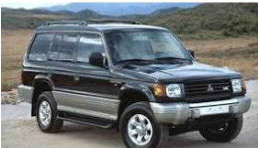
Figure 2000 Mitsubishi Montero Review & Ratings | Edmunds

TS Grewal Accountancy Class 12 Solutions - Volume 1 , The answers to the TS Grewal books are the best study material for students. Listed below are the chapter-wise TS Grewal Accountancy Class 12 Solutions CBSE. shaalaa.com/textbook-solutions/ts-grewal-solutions-class-12-accountancy-double-entry-book-keeping-volume-1_121