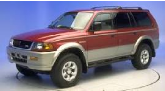
Figure 2000 Mitsubishi Montero Sport

2 Mitsubishi Montero Bekas - Mitula Mobil , 8 Jun 2024 — Mitsubishi pajero 2000 solar 2000 mitsubishi pajero 3 2 suv. 7 gambar. 2000 Mitsubishi Pajero 3.2 SUV · Rp. 300.000.000 Harga total. 2000. mobil mitula co id/mobil/mitsubishi-montero