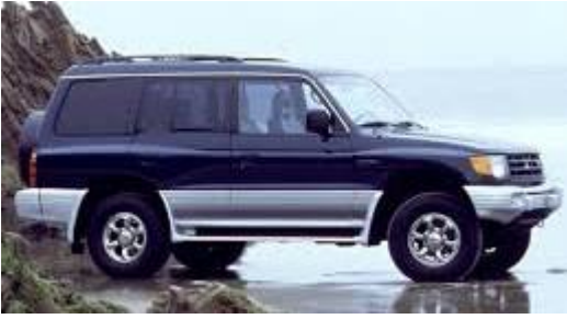
Figure 2000 Mitsubishi Montero Specs, Price, MPG & Reviews | Cars.com

2 Mitsubishi Montero Bekas - Mitula Mobil , 8 Jun 2024 — Mitsubishi pajero 2000 solar 2000 mitsubishi pajero 3 2 suv. 7 gambar. 2000 Mitsubishi Pajero 3.2 SUV · Rp. 300.000.000 Harga total. 2000. mobil mitula co id/mobil/mitsubishi-montero