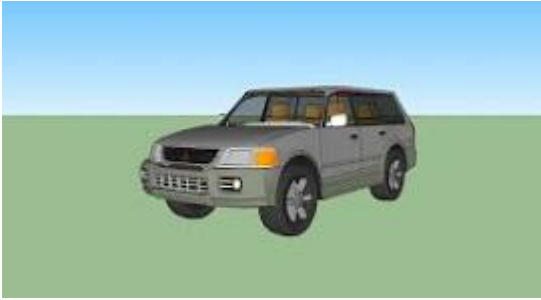
Figure 2000 Mitsubishi Montero Sport full size SUV - - 3D Warehouse

2000 Mitsubishi Montero Sport - Cars.com , Research the 2000 Mitsubishi Montero Sport at Cars.com and find specs, pricing, MPG, safety data, photos, videos, reviews and local inventory. cars.com/research/mitsubishi-montero_sport-2000/