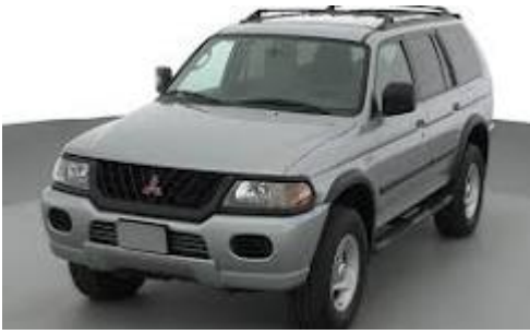
Figure 2000 Mitsubishi Montero Sport

2000 Mitsubishi Montero Sport - Cars.com , Research the 2000 Mitsubishi Montero Sport at Cars.com and find specs, pricing, MPG, safety data, photos, videos, reviews and local inventory. cars.com/research/mitsubishi-montero_sport-2000/