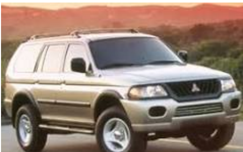
Figure 2000 Mitsubishi Montero Sport LS Sport Utility 4D

NEW Chrome Grille For 2000-2004 Mitsubishi ... , ponxxi.sumutprov.go.id is the best online shopping platform where you can buy NEW Chrome Grille For 2000-2004 Mitsubishi Montero Sport MI1200227 SHIPS TODAY ... ponxxi sumutprov go id/new-chrome-grille-for-2000-2004-mitsubishi-montero-sport-mi1200227-ships-today-QVdbTUFRH0dMXkVC