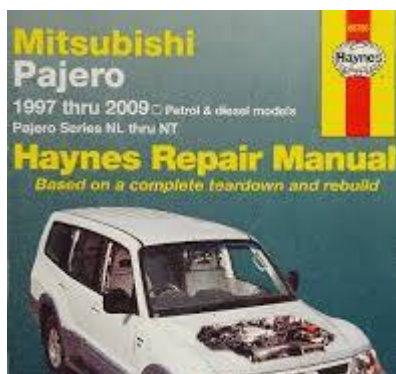
Figure Haynes Mitsubishi Pajero Automotive Repair Manual 1563927918 ...

Owner's Manuals , Owner's manuals are free to download and provide everything you need about your car's operation. Download a PDF of your Owner's Manual and operation documents using the model lists below. mitsubishi-motors.co.uk/manuals-and-guides/owners-manuals/