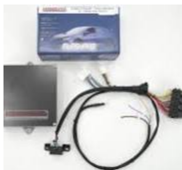
Figure Hondata: Honda/Acura Engine Management Solutions

2002 MDX Online Reference Owner's Manual Contents , One of the best ways to enhance the enjoyment of your new Acura is to read this manual. In it, you will learn how to operate its driving controls and. http://techinfo.honda.com/rjanisis/pubs/OM/AH/B3V0202OM/enu/MD0202OM.pdf