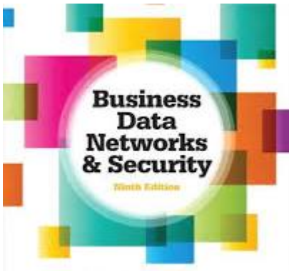
Figure Business Data Networks and Security (9th Edition)